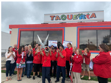
▲ Taco Fiesta Hinojosa