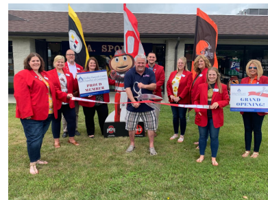
▲ M.A. Sports Man Cave HQ