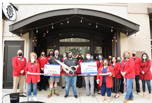
▲ Modcraft Brewing