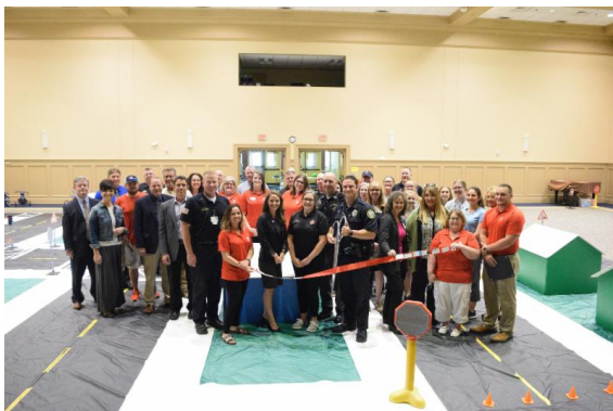
Wish Children's Boutique & Pointe of Joy Dance Boutique ▶