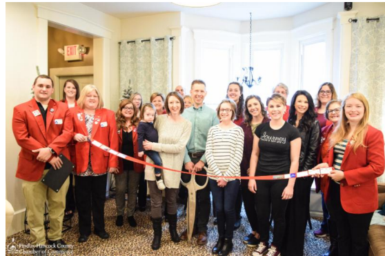
▼ Journey Salon & Day Spa