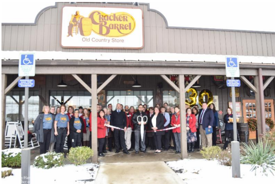
▲ Cracker Barrel