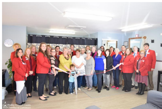
▲ Seams Fitting