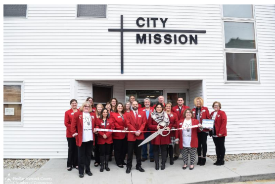
▲ City Mission of Findlay