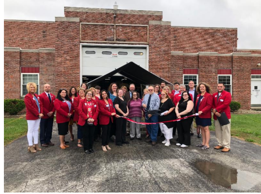
▲ 35 LLC