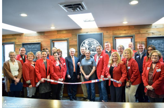
▲ Campus Pollyeyes