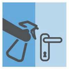
CLEAN AND DISINFECT "HIGH-TOUCH" SURFACES OFTEN