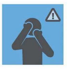
AVOID TOUCHING YOUR EYES, NOSE, OR MOUTH WITH UNWASHED HANDS OR AFTER TOUCHING SURFACES