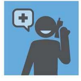
CALL BEFORE VISITING YOUR DOCTOR